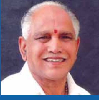
Sri. B. S. Yediyurappa

Honorable Chief Minister Government of Karnataka