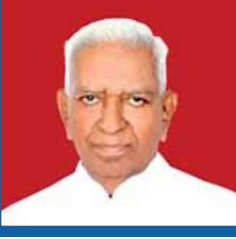
Sri. Vajubhai Vala His Excellency Honorable Governor of Karnataka